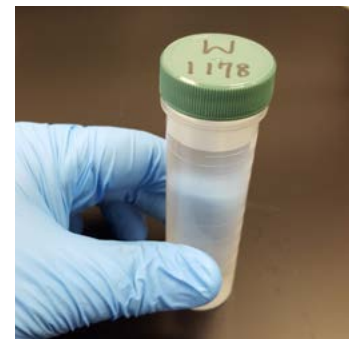
Liquid sample in plastic vial.